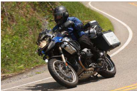
Getting down on the "Tail of the Dragon"

After the "Tail" I headed east in a bit of "Smoky Mountain National Park" and back out through Pigeon Forge and Gatlinburg which was heavy with traffic from the summer vacationers. But I worked my way through it and it made to Johnson City by about 630pm for my overnight. The next day the seminars began at 8am sharp and by that afternoon the rest of the 'troops' had arrived and setup their camp nearby. Unfortunately it was on a bit of sloping hill and that proved to be lots of 'fun' with the evening rains.....but I was quite comfortable in my accommodations! I am sure everyone was jealous!