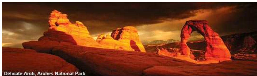
Delicate Arch, Arches National Park